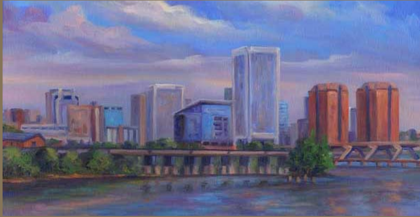
Richmond Skyline