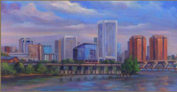
Richmond Skyline